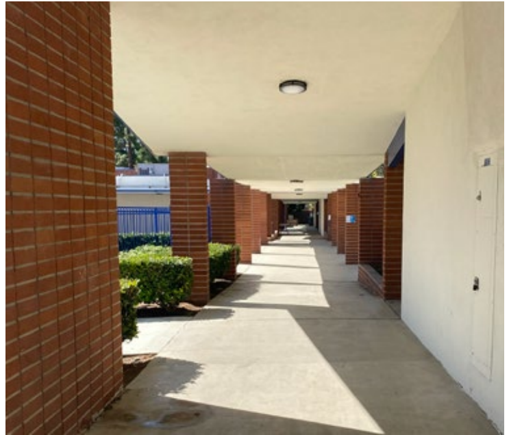
Replaced all corridor lighting with modern LED fixtures