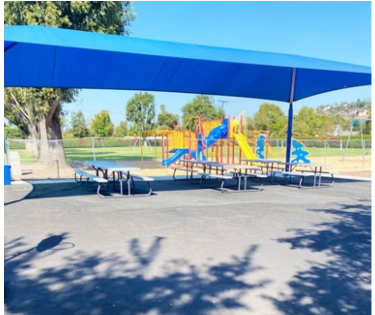
New Blacktop for Room 100 (Grades 1/2) Lunch Area