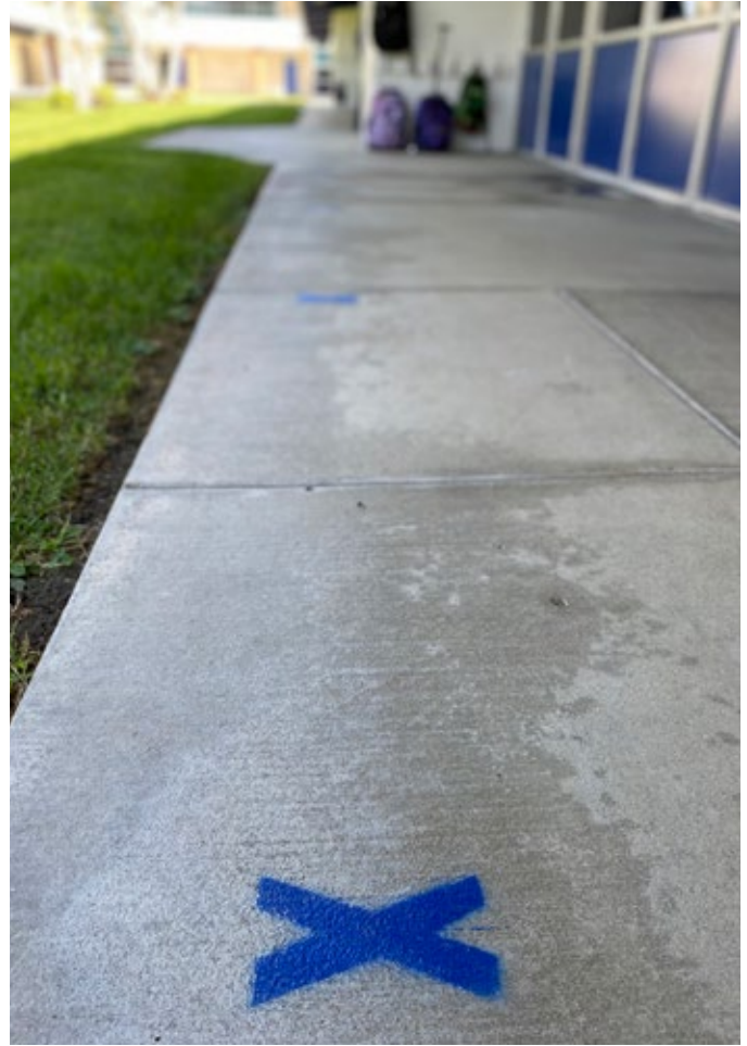
X Marks the Spot! Visual markers help students with their 6' distances.

Students must follow our Safe at Prentice rules including standing 6' apart in lines, washing their hands for 20 seconds in their classroom sink each time they enter the room, wearing their masks on campus and helping with sanitizing including wiping down their desks (with their teacher's help) and enforcing the rules at all times.