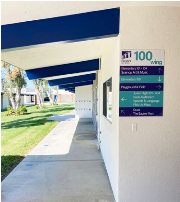
Freshly Painted Halls, Doors and Corridors