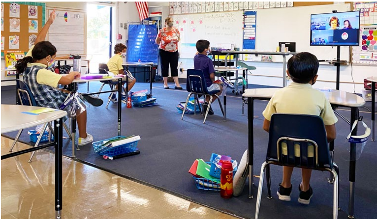
In-class and remote students learning together via our Live Classroom model.