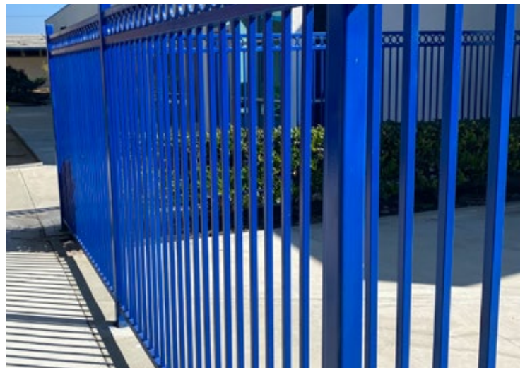
All wrought iron fencing repainted Prentice blue